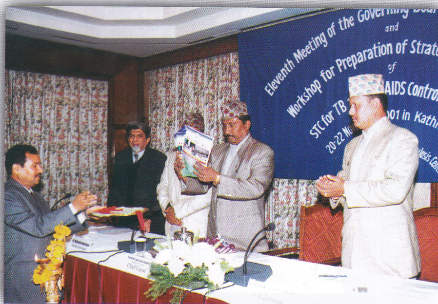
(Report is being released by Hon'ble Health Minister)

STC has published a compiled report on World TB Day 2001 based on the reports received from the Member Countries. This report is distributed to the Member Countries as per the mailing list prepared by the STC.