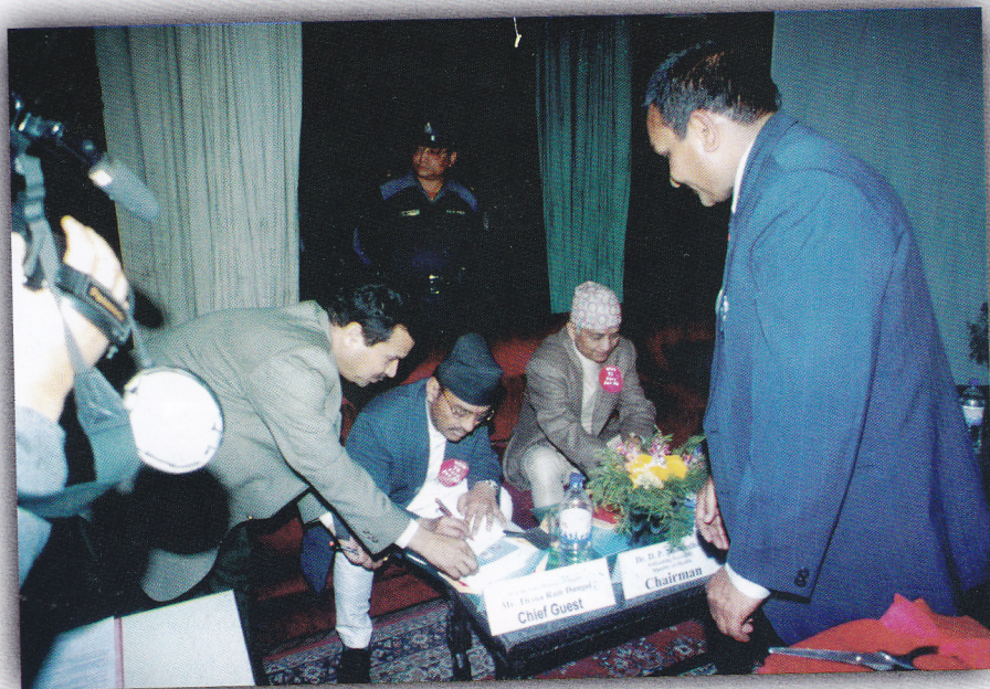
(Joint Programme at City Hall of Kathmandu)

A programme was organized jointly with the organizations working for TB control in Nepal. The Hon'ble Tirtha Ram Dongol, Minister of State for Health, graced the function as a Chief Guest. The joint programme was attended by large number of policy makers, diplomats, intellectuals, journalists, students, bureaucrats, technocrats, teachers, community leaders, businessmen, officials, doctors, health workers, social workers. The function was presided over by the Officiating Secretary for Health.