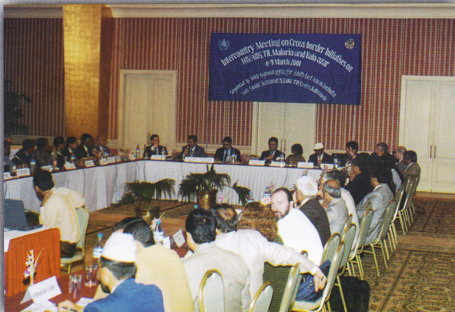
(Technical session of the Meeting)