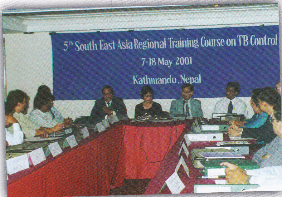
(Inaugural session of the training course)

Asia Region participated in the training. The course was facilitated by the facilitators from SAARC TB Centre, National TB Centre of Nepal, WHO HQ, WHO/SEARO, TRC Chennai and experts from outside the Region.