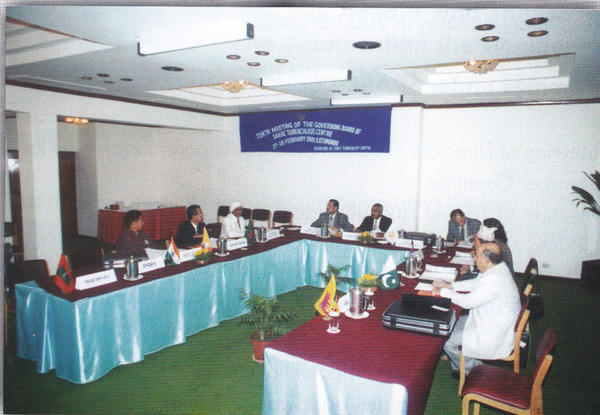
(Meeting of the STC Governing Board Members)

The Governing Board of SAARC Tuberculosis Centre (STC) held its tenth meeting in Kathmandu on 27 – 28 February 2001, which reviewed the progress of the Centre and discussed the related matters in detail. The meeting recommended the following activities to be carried out by the Centre for the year 2001: