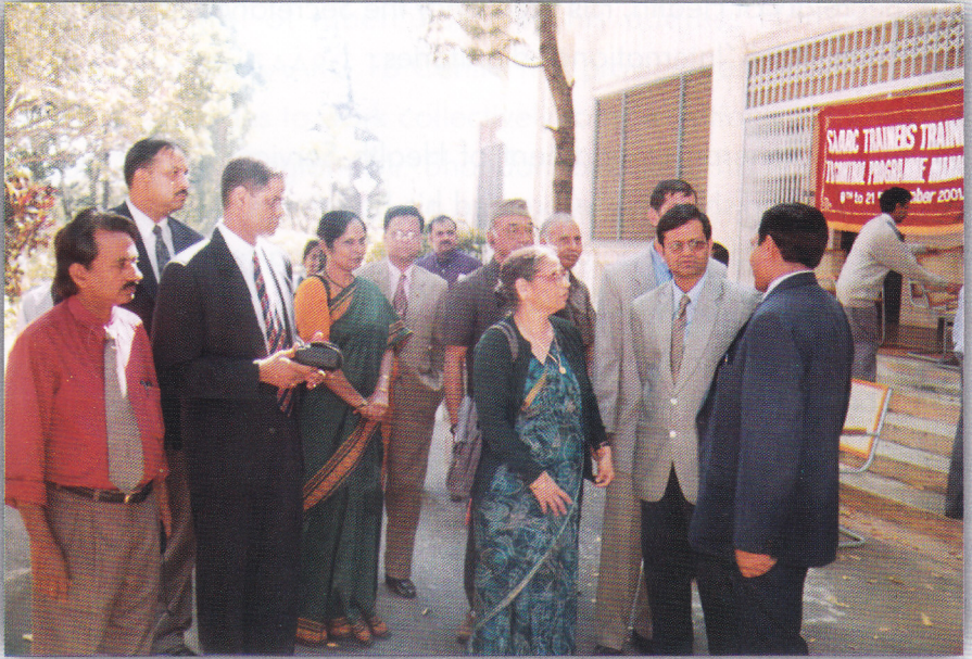
(Participants along with the facilitators gathering at the training venue at NTI, Bangalore.)

The training in TB control has been taken as a major activity of the Centre since its establishment. The STC organizes training programmes for trainers of different levels of TB control programme managers and workers. For the better impact of the training, STC has taken a policy to organize at least one activity in Member Country other than host country in a year. This year the training programme was organized at National TB Institute, Bangalore, India from 8th to 21st December 2001. During that opportunity, SAARC Charter Day was also celebrated in the same institute.