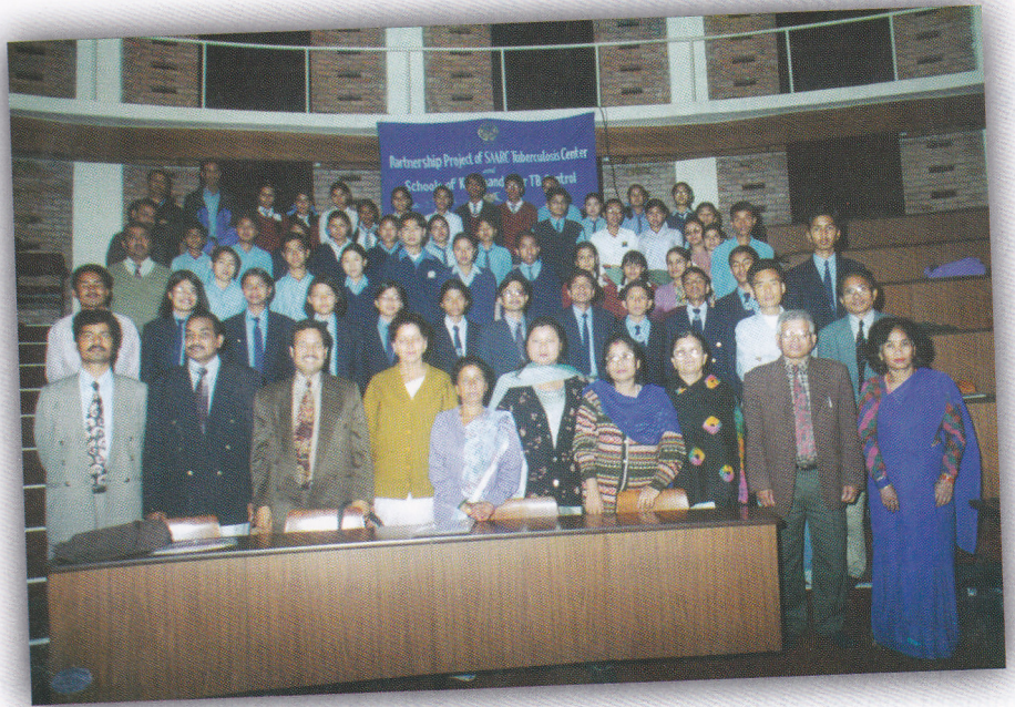
(Participants of the School Project at the Briefing Programme organized at STC hall)

A briefing programme was organized for the school students under the partnership programme on 22 March 2001. Students from different schools of Kathmandu valley visited the SAARC TB Centre where the Director, Deputy Director and President, NATA, Kathmandu-branch explained the role of students in TB control to the visiting students.