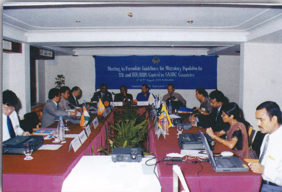
(Technical Session of the meeting)