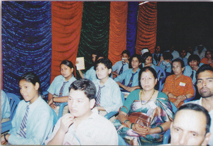
(Participants of the School Project, Briefing Programme organized at Far West of Nepal)

The STC has expanded this partnership programme out of the valley as well and organized a programme in Dhangadhi, (a densely populated city) on 18 th April 2001 in Far-western Region of Nepal.