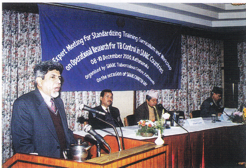
(Inauguration of the Expert Meeting & Workshop)