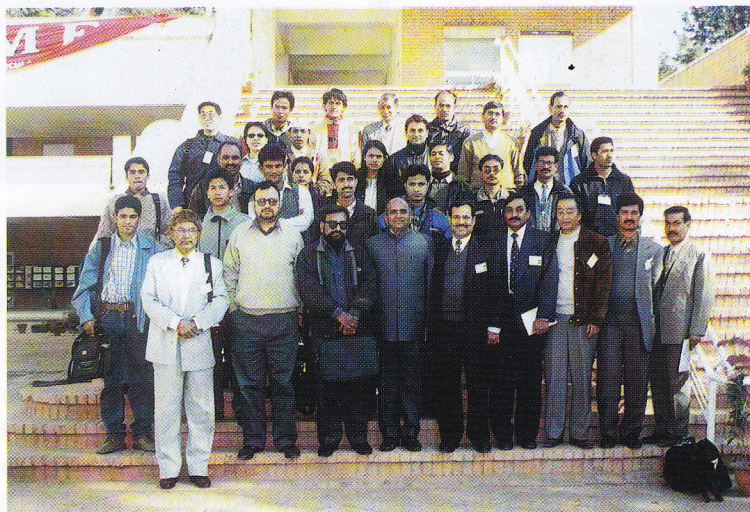
Journalists and officials of STC after completing the briefing programme

An exhibition of various information related to TB and HIV/AIDS, health education material collected from the Member Countries, report of important events, STC publications, information about the involvement of new partners in TB control, progress on SAARC-CIDA cooperation and achievements of STC were displayed. This exhibition was also organized on the occasion of the Charter Day. The journalists observed the exhibition and expressed their views.