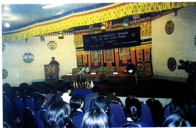
(Inaugural function of the SAARC TB Managers' Training Programme)