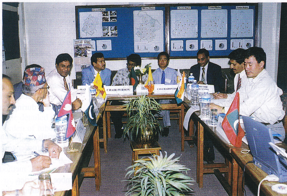
Scientific session of the Seminar

The programme was concluded jointly with the regional training programme organized by WHO/SEARO.