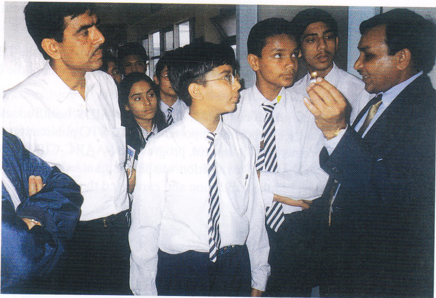
(Students during the STC Visit)

A joint project to involve school children has been designed by STC and KVK to develop students to deliver messages on TB and its control. The students have been identified as new partners considering the facts that: