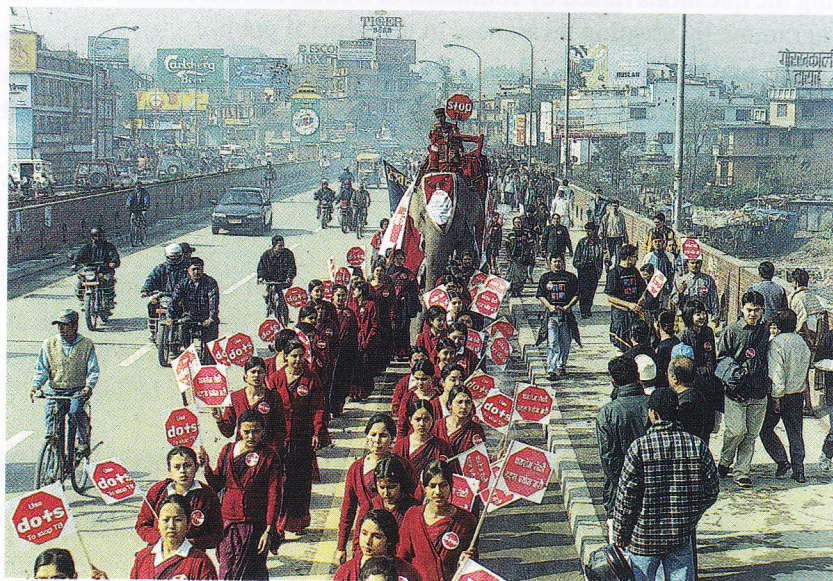
(Procession of the students, scouts and general people during the World TB Day)