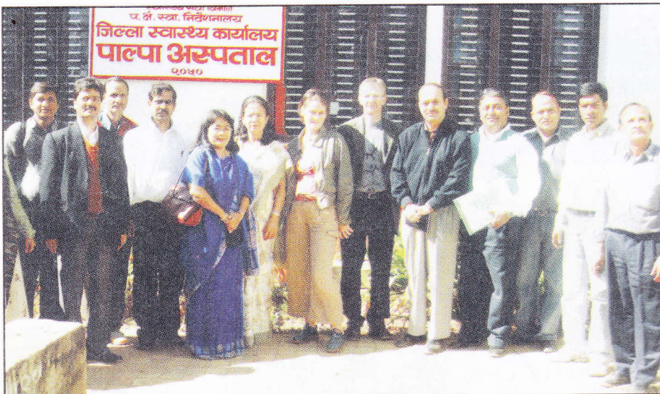
Participants of the international review of NTP Nepal.