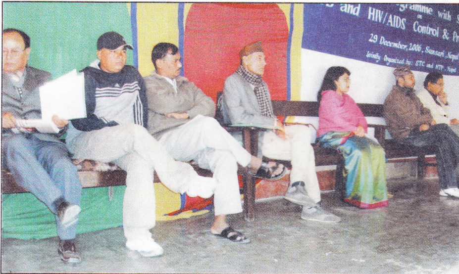
Opening session of school partnership programme held at Sarada Secondary School, Khanar, Sunsari