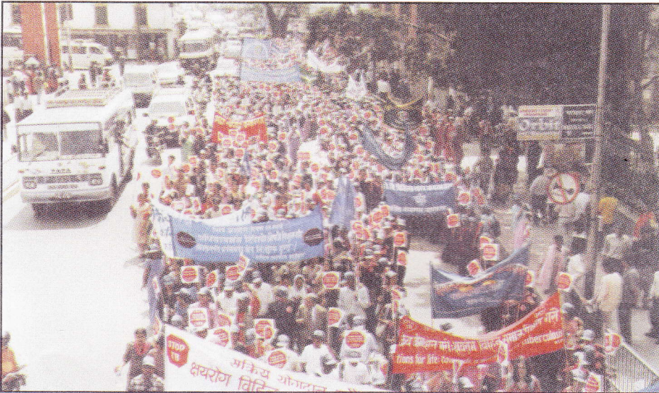
Rally to commemorate World TB Day 2006 held in Kathmandu