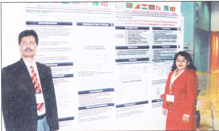
Presentations from STC at the 37 th Global Conference organized by IUATLD in Paris