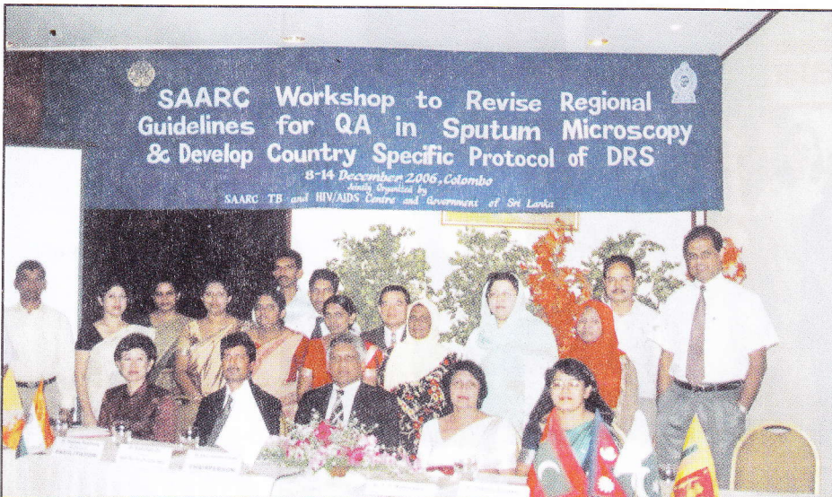
Inauguration of SAARC Regional Workshop to Revise Regional Guidelines for QA in Sputum Microscopy & Develop Country Specific Protocol for DRS held in Sri Lanka