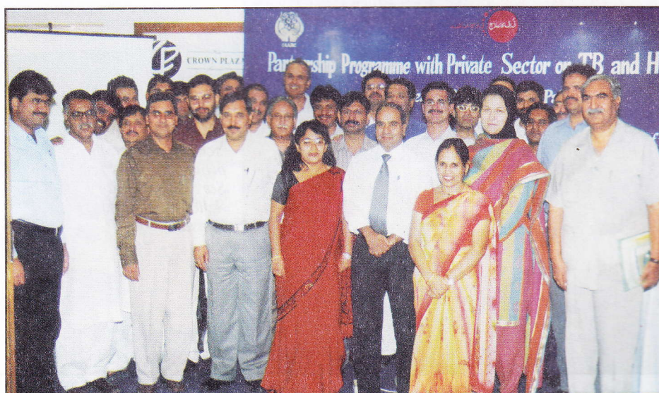
Participants and Facilitators of Partnership with Private Sector in Control of TB and HIV/AIDS held in Islamabad, Pakistan