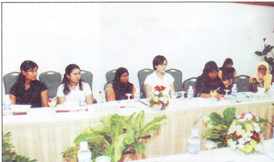
Opening function of Partnership Programme with Travel Agency on control of TB and HIV/AIDS held at Male, Maldives