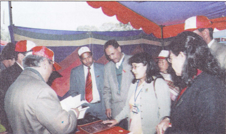
Deputy Prime Minister/Health & Population Minister observing STC publications at the stall displayed to mark the World AIDS Day 2006 in Kathmandu