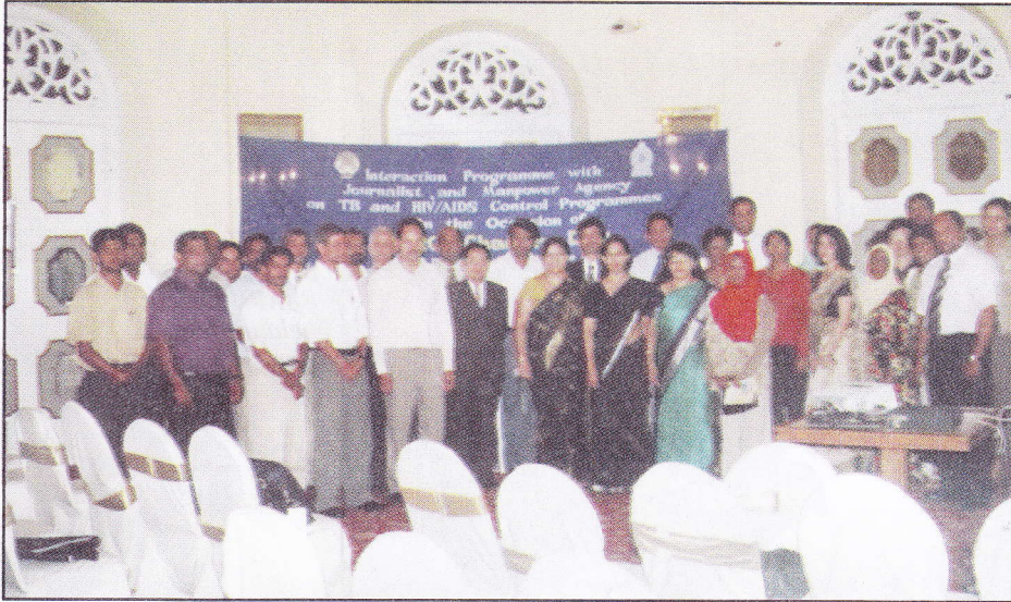
Participants and Facilitators of Partnership Programme with Journalists in Control of TB and HIV/AIDS held in Colombo, Sri Lanka