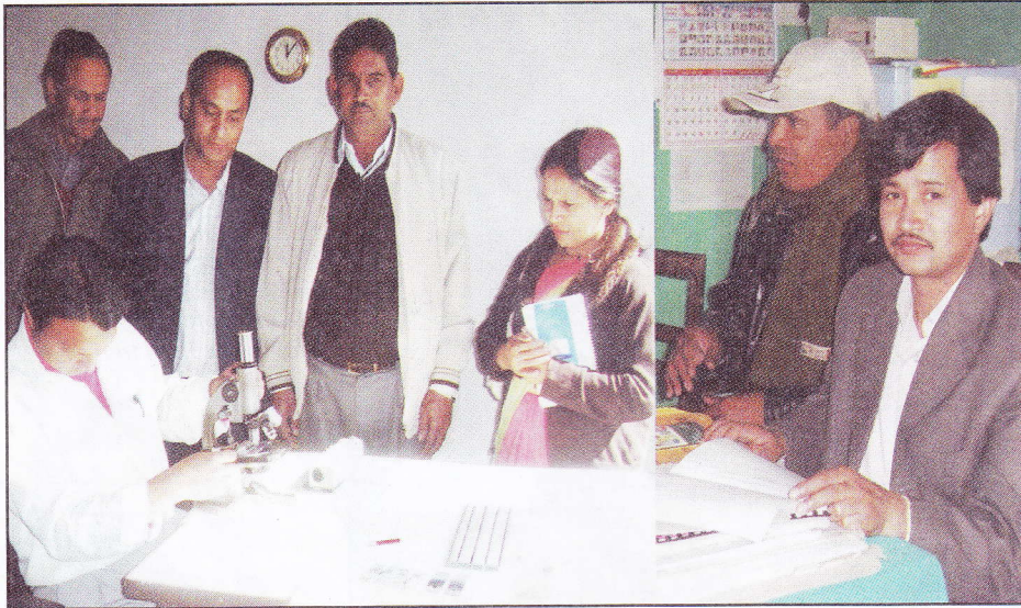
Observation of TB Control Programme at Morong District during Situation Analysis of TB and HIV/AIDS Control Programme in Nepal