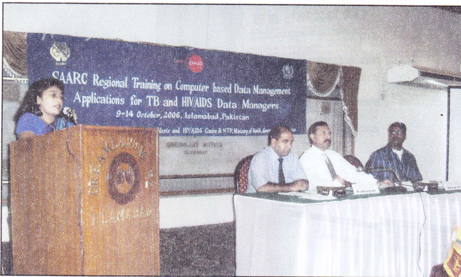
Participants with the Chief Guest at ToT on DOTS Plus Programme held in Kathmandu Inauguration of SAARC Training on Computer based Data Management for TB & HIV/AIDS held in Pakistan