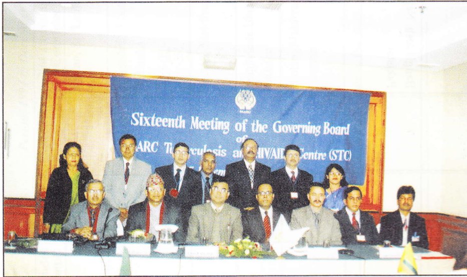
16 th Governing Board Meeting of SAARC TB and HIV/AIDS Centre