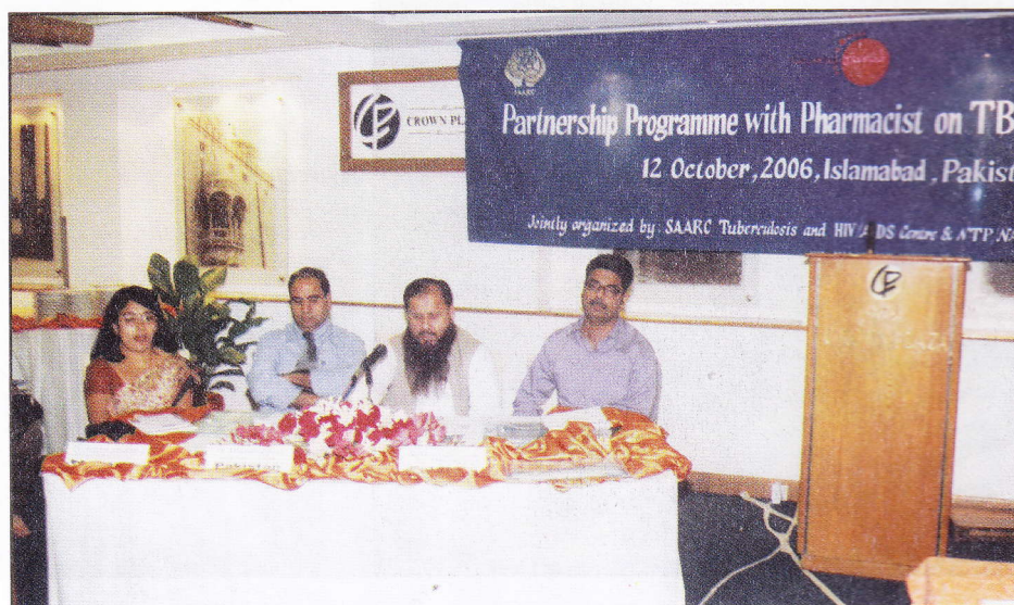
Participants and Facilitators of Partnership with Pharmacist in Control of TB and HIV/AIDS held in Islamabad, Pakistan