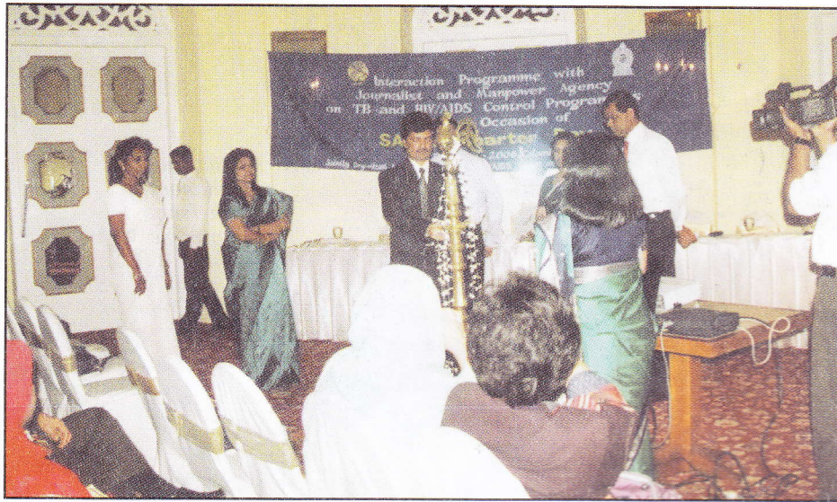
Inaugural Programme of Celebration of SAARC Charter Day held in Colombo, Sri Lanka