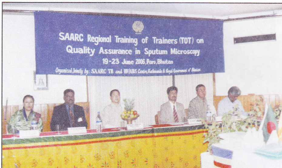
Inauguration of ToT on QA held in Bhutan