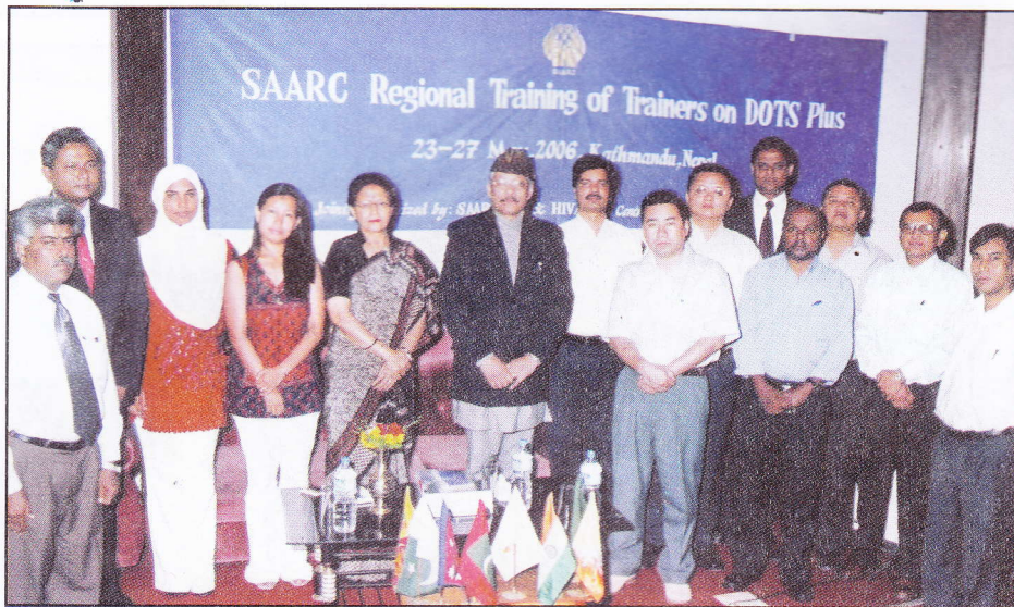
Participants with the Chief Guest at ToT on DOTS Plus Programme held in Kathmandu