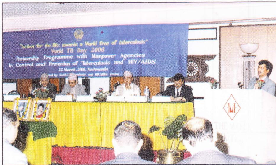
Director STC is addressing the participants at the function