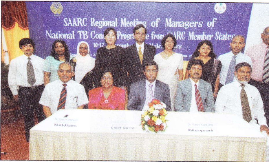
Participants and Facilitators in the SAARC Regional Meeting of NTP Managers held in Maldives