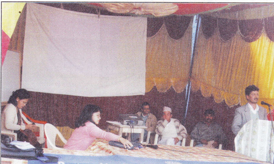
Director STC addressing the participants at the Partnership Programme with Industry on TB and HIV/AIDS control and Prevention at Birjung