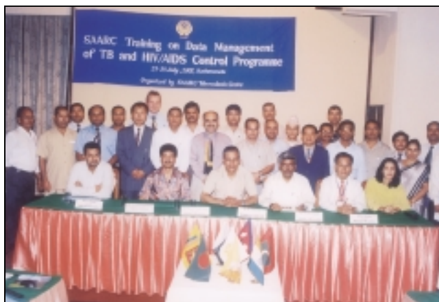
Director General, Department of Health Services, Government of Nepal and participants of the Data Management Training, Nepal