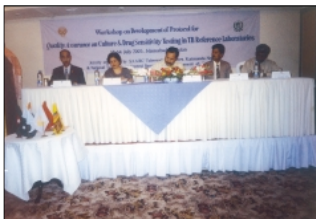
NTP authorities of Pakistan and officials of STC participating in the workshop on development of protocol for QA on culture & drug sensitivity testing in TB reference labs. , held in Islamabad, on July 12-14, 2005