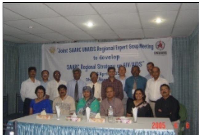
Participants of Joint SAARC-UNAIDS Regional Expert Group Meeting to Develop SAARC Regional Strategy on HIV/AIDS, held in Dhaka on April 4-6 April 2005.