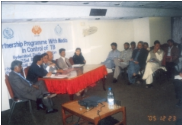
Partnership programme with Media – STC and NTP, Pakistan officials with media people at partnership programme with media held in Hyderabad, Pakistan