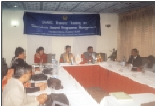
Inaugural session of SAARC Trainers' Training on TB Control Programme Management , held in Islamabad, Pakistan on December 12-21, 2005