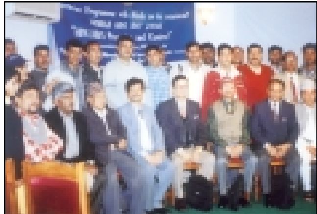
STC Director and Media People after completion of the interaction programme with Media on the occasion of World AIDS Day 2005 , Birgunj, Nepal