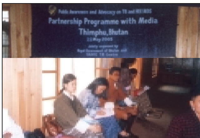
Journalists from media agencies, Thimphu participating at the partnership programme with media organized in Thimphu.