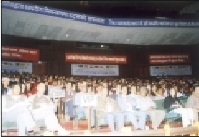
Audience at the joint function organized to observe the World TB Day 2005 in Kathmandu