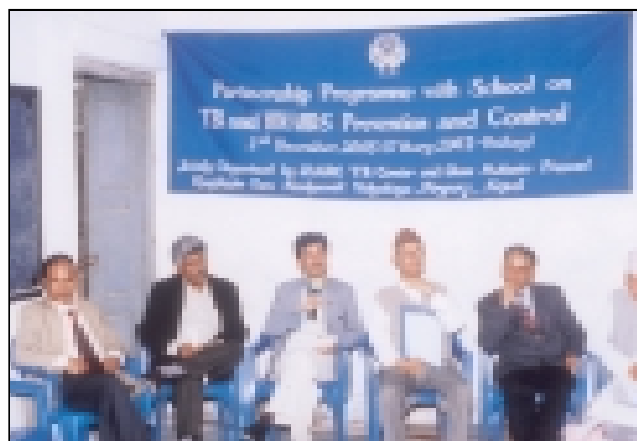
STC Director and School dignitaries during the partnership programme with school held at Shri Mahabir Prasad Raghbir Ram Madhyamik Vidyalaya, Birgunj, Nepal.