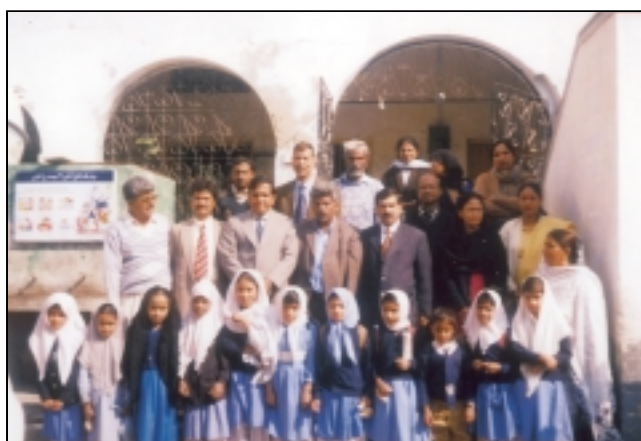
Students of Government Himayat-ul-Islam Girls High School, Hyderabad, Sindh, Pakistan with officials from NTP Pakistan and PTP Sindh during partnership programme with school organized jointly by STC and NTP Pakistan.