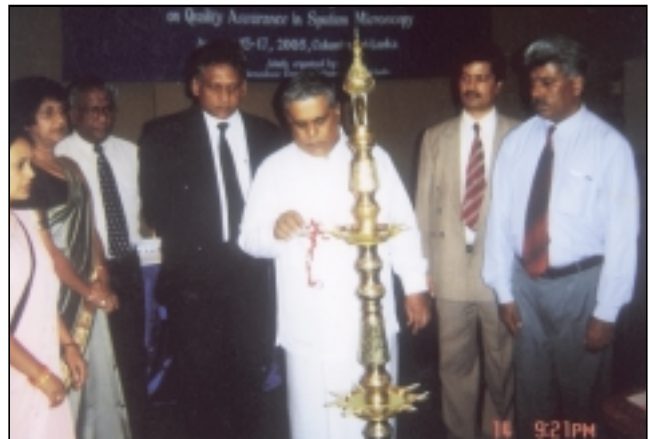
Hon'ble Nimal Siripala de Silva, Minister of Health Care, Nutrition & Uva-Wellassa Development, inaugurating SAARC Regional training for Laboratory Trainers on Imparting Training on QA in Sputum Microscopy , held in Colombo, Sri Lanka on August 15-17, 2005