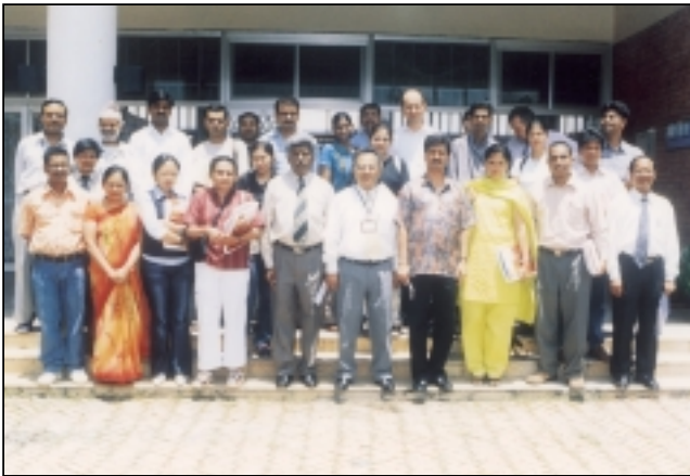
Visit of Journalists from PANOS South Asia at STC on July 28, 2005