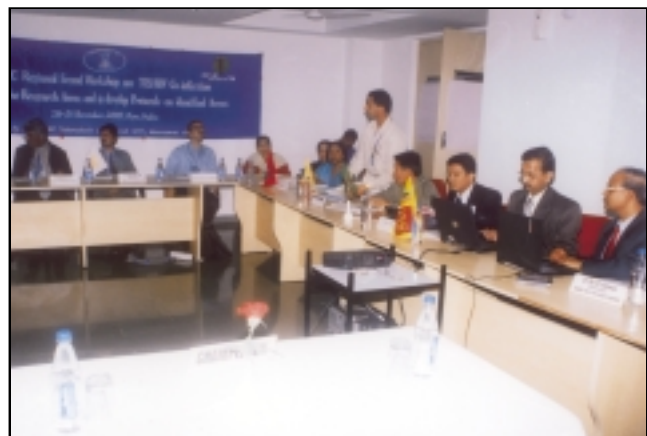
SAARC Regional (Second) Workshop on TB/HIV Co-infection to identify Research Areas & to Develop Research Protocol on the Identified Areas & Study Visit to TB/HIV (pilot project) Implementation sites, held in Pune, India on Dec. 28-31, 2005