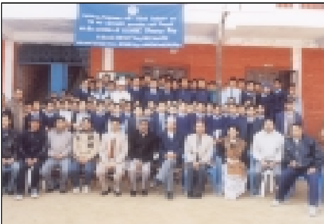
STC Officials, Teachers and Students at Prabhat Higher Secondary School, Lalitpur, Nepal Celebrating 21 st SAARC Charter Day 2005