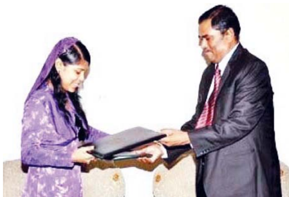
Hon'ble Mr. Upendra Yadav, Deputy Prime Minister & Minister for Foreign Affairs, Government of Nepal and Her Excellency Uz. Fathimath Dhiyana Saeed, Secretary General, SAARC

Information Centre on 3 rd June 2011 in Kathmandu. The signing ceremony was attended by the Foreign Secretary and other senior officials of the Ministry of Foreign Affairs, Government of Nepal, Directors of both the Regional Centres and the concerned Directors from the SAARC Secretariat.